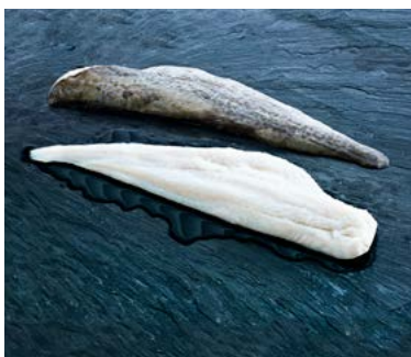
Desalted Cod Fillets