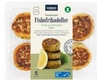
Cod Fish Cakes with Vegetables 4x65 g