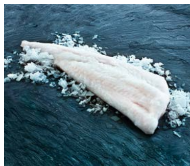
Cod Fillets Light Salted