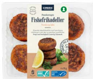
Cod Cakes with Salmon 4x65 g