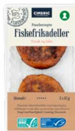
Cod Fish cakes with Salmon 2x65 g