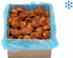
Mini Bio Salmon Cakes Bio salmon and bio vegetables, 25 g