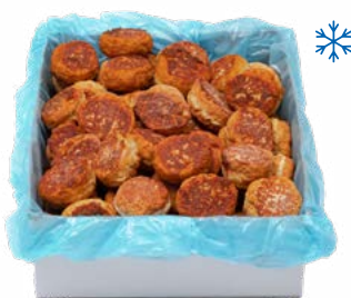
Cod Fish Cakes 90% line caught cod, 85 g