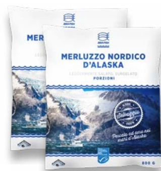
Branded Packaging Available for all products