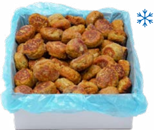
Cod Fish Cakes with Vegetables 90% line caught cod and vegetables, 65 g