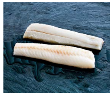
Desalted Cod Loins