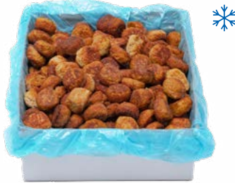
Mini Fish Cakes with Prawns and Chili 82% line caught cod and prawns, 25 g