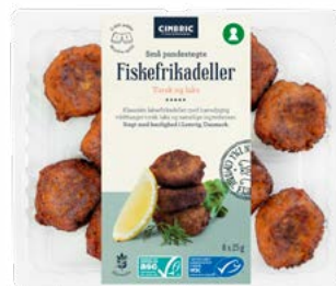
Mini Cod Fish Cakes with Salmon 8x25 g