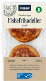
Cod Fish Cakes 2x65 g