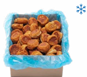
Mini Cod Fish Cakes 90% line caught cod, 25 g