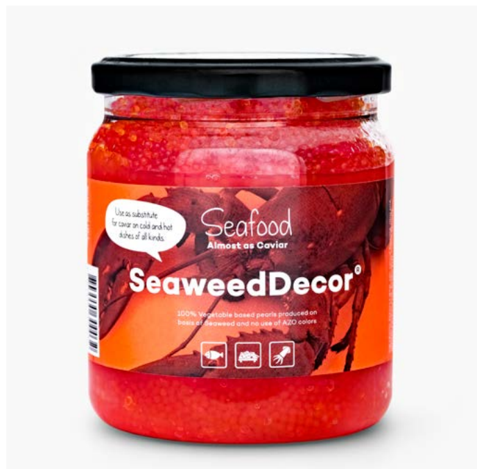
Seaweed Decor Red 450 g