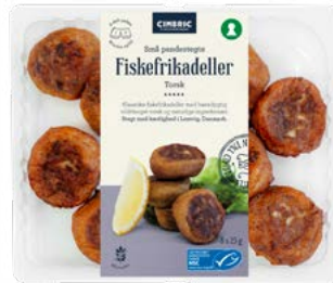
Mini Cod Fish Cakes 8x25 g