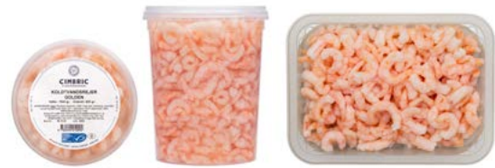
Cold Water Prawns — Golden