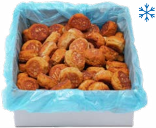
Cod Fish Cakes 90% line caught cod, 65 g