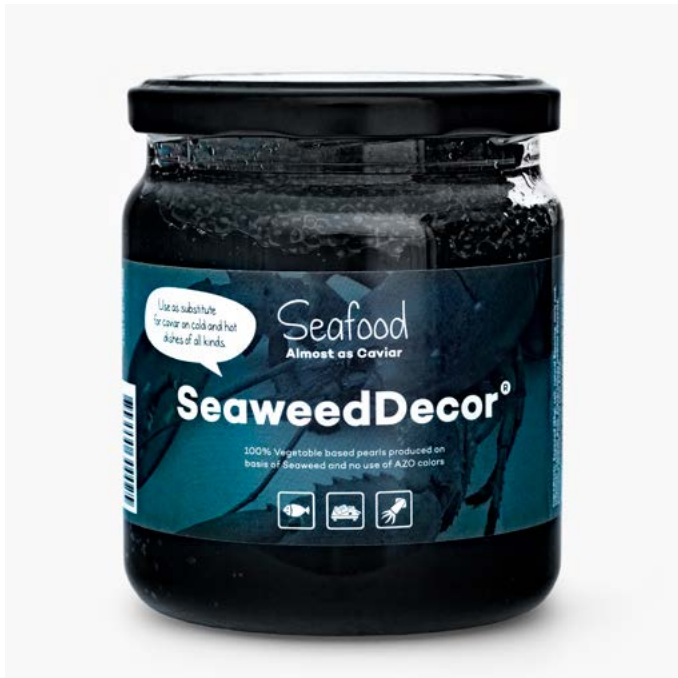
Seaweed Decor Black 450 g