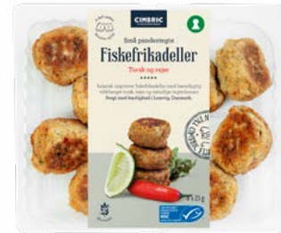
Fish Cakes with Prawns and Chili 8x25 g