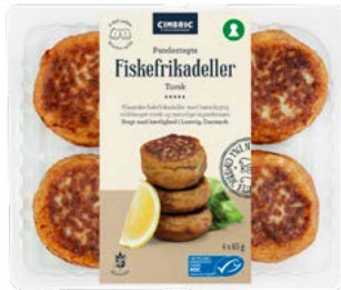
Cod Fish Cakes 4x65 g