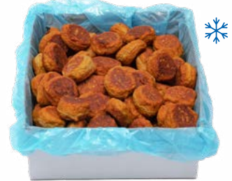
Cod Cakes with Salmon 90% line caught cod and salmon, 65 g