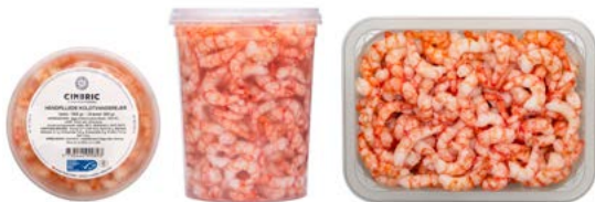
Hand Peeled Cold Water Prawns