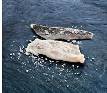
Wet Salted Cod Wings