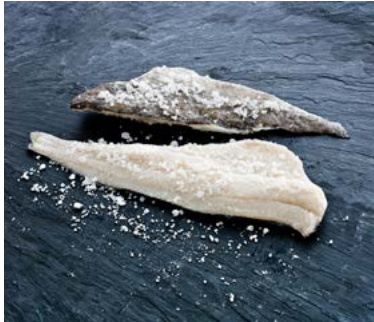
Wet Salted Cod Fillets